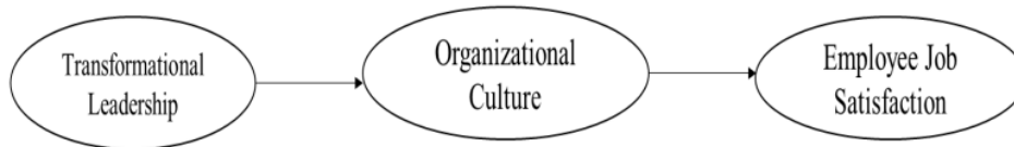
Figure 1. Research Concept Framework