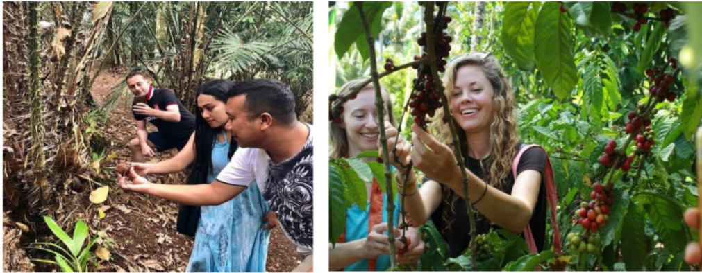
Figure 2: Potential of salak and coffee plantations in the village of Munduk Temu Bali