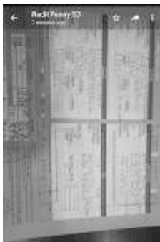
WhatsApp Image 2021-04-30 at 11.16.33 AM.jpeg 106K