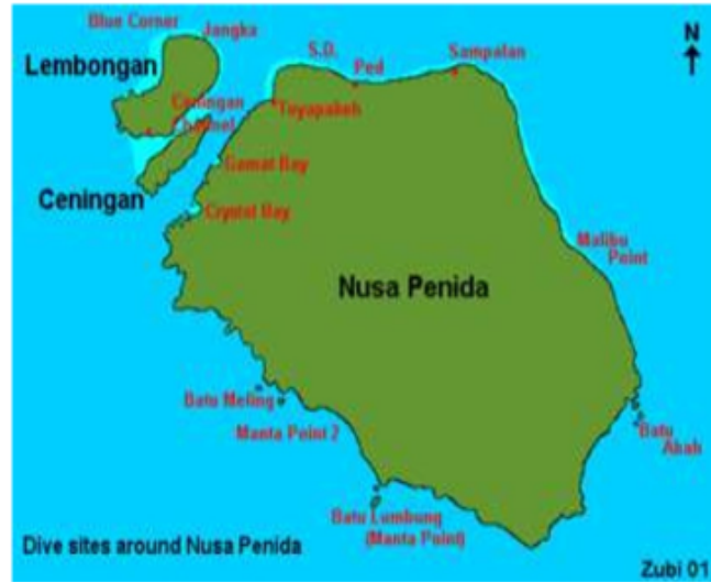
Fig. 1 Nusa Penida Island, Bali, Indonesia

method used was purposive sampling where participants were determined intentionally for a particular purpose local resident, village government staff and tourist who lived while the research was carried out. The study has been conducted for 12 months, starting from November 2017 to October 2018. The interview process was done at Nusa Penida Island. Deep interview used questioner for guiding the discussion.