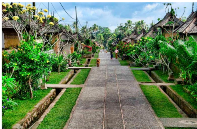
Figure 1. Telajakan in Penglipuran, Bali Traditional Village, Bangli Regency, Bali (Tika, 2015).

The sector of forestry, agriculture and plantation agroforestry activities are already familiar. Agroforestry is a form of soil and water conservation combining tree crops, or annual crops with other agricultural commodity crops which are planted together or alternately (Gintings, 1982). Planting trees, which are annual crops, can reduce soil erosion better than agricultural crops, especially seasonal plants. Selected annual plants should be of the type that can provide added value to farmers from fruit and wood products. Besides being able to produce faster and greater profits, agroforestry is also a very good system ecologically, economically and socio-culturally (Kalcic et al. , 2015). Knowledge interfacing and sharing towards co-producing collaborative products helps to clarify the performance-based indicators for effective payment for watershed services negotiation between potential sellers and buyers of ecosystem services (Cuvelier & Greenfield, 2016; Leimona et al. , 2015). Various agroforestry plant species in Bali, including coffee, Albizia chinensis , and the latest mulberry (Sasmita et al. , 2019), shallot ( Allium ascalonicum L. especially in Kubu Tambahan Sub-district (Purba et al. , 2020), petsai ( Brassica chinensis L.) even in Bali (Purba et al. , 2019).