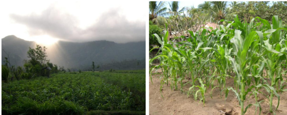
Figure 2. Abian (left) and kebon (right) land in Bali 3

Until now the land use system of abian , kebon and telajakan has an important role as a source of fulfilling community needs. The benefits of abian , kebon and telajakan are as a source of daily food needs, a source of income and other environmental service benefits. Abian , kebon and telajakan as a traditional agroforestry system in Bali have not received the attention and recognition of various parties both the government and local government agencies, agriculture, forestry in the development and use of land in their area. This study aims to evaluate the value and benefits of traditional dry land use ( abian , kebon and telajakan ) in the Bali area.