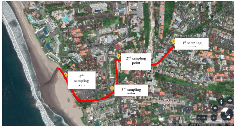
Figure 1 Sampling location along the river and estuary around Petitenget Temple