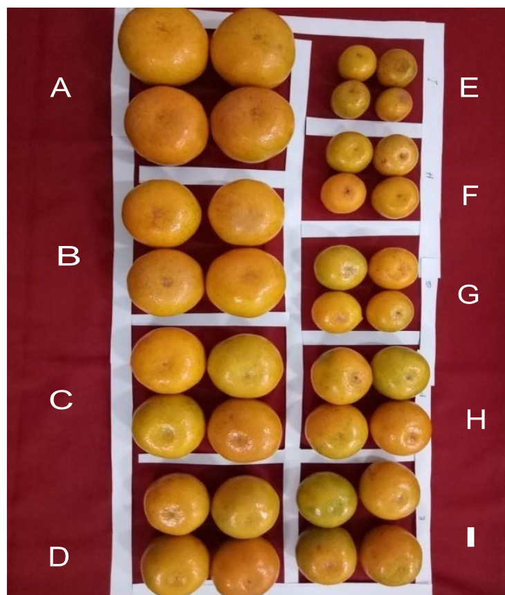
Fig. 1. Visual Physical Citrus Fruit Infected with CVPD Disease

Healthy citrus plants produce fruit with a larger weight and fruit circumference that weighs 216.20 g. with a fruit circumference of 25.70 cm, while the sick citrus plant has a smaller fruit size, has a small fruit circumference as in Table 4. Healthy orange has fresh fruit, large size, fruit rim is also large and high water content. The more severe the CVPD attack rate on the citrus plant the smaller the quantity and quality of the resulting fruit as shown in Fig. 1 and 2.