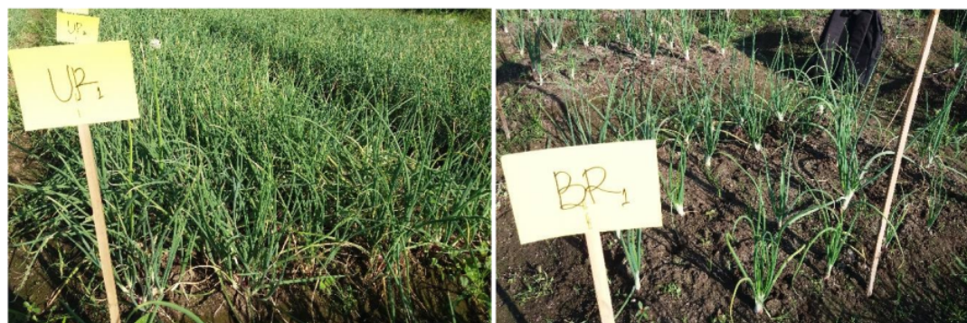
Figure 3. Performance 56 days after planting shallot which propagated by bulbs (left); true shallot seed (right) which soaked in 2% Rhizobacteria and given Rhizobacteria in the field