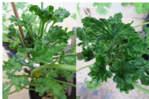
Figure 1. Inoculum source of ZYMV isolates Bali on zucchini plants