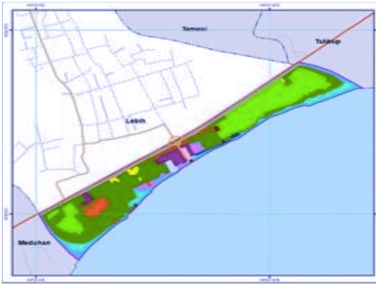
Fig. 2 Map Analysis of Land Use in Lebih Beach, 2022