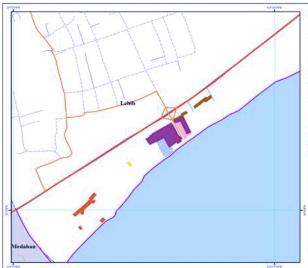
Fig. 3 The Discrepancy Map of Land-Use in the Coastline area