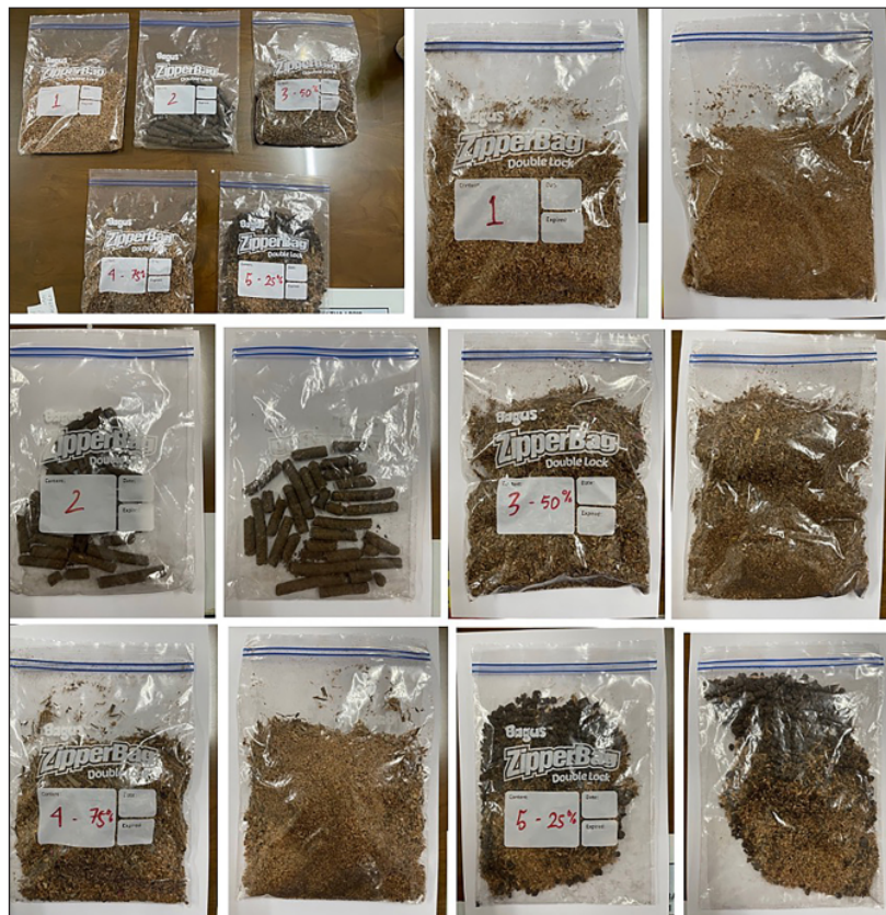
Figure 1. RDF material samples

Biomass briquettes are made using a press machine to print biomass into a pellet shape with a length of 5–10 cm and a diameter of 1 cm. The dried temple waste then proceeds to some machines to produce the RDF. A chaff cutter machine (MCC) series 6-200 with GC-200 Engine and 6.5 horsepower (hp) was used to grind the