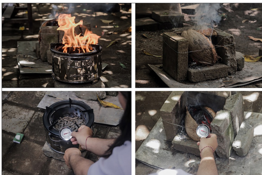
Figure 2. Product combustion and durability test

reduce the presence of contaminants and increase their durability in storage. Infrastructure for storing RDF, such as appropriate flooring, drainage systems, fire prevention measures, and adequate space for equipment manoeuvrability, is essential for guaranteeing its durability. Monitoring RDF on a regular basis is necessary to detect degradation or changes in its properties over time. This may entail periodic sampling and analysis of RDF samples in order to evaluate variables such as moisture content, energy content, and physical properties. By implementing appropriate storage practices and maintaining suitable storage conditions, stored RDF can be optimized, ensuring that its quality and energy content remain suitable for combustion or other uses.