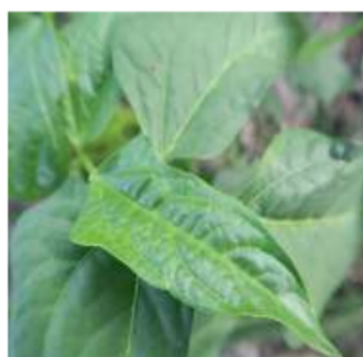
A. Long beans