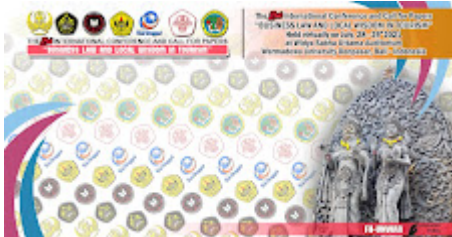
Virtual Background 2nd ICBLT FH Unwar.jpeg 141K