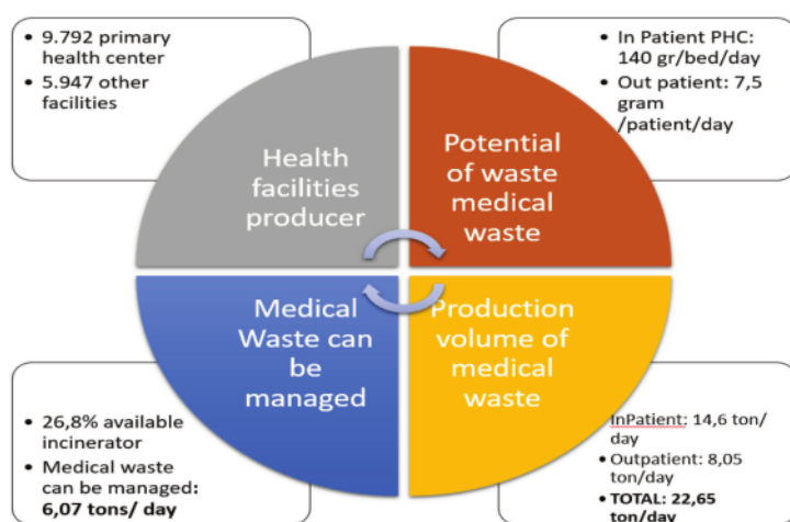
Figure 1 Matrix production cycle of medical waste in primary health facilities in Indonesia

The Medical waste management of PHC in Payangan consisted of 5 people in which 2 of them were sanitarian cleaning service. Based on workload analysis using WHO method of Medical waste management employee at the health center Payangan of 5 people consisting of 2 and three people sanitarian cleaning service. Workload analysis conducted by the WHO method of Workload Indicator of Staffing Requirements, it appears that 4.72 or