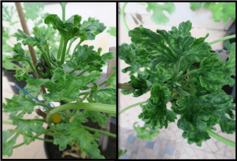
Figure 1. Inoculum source of ZYMV isolates Bali on zucchini plants

Note: C+ (without extract application) Type of disease symptom*: Y = yellowing, Yc = yellowing with cupping, M = mosaic, Mc = mosaic with cupping, St = stunting Negative control: healthy plants (without virus inoculation and extract application) Positive control: sick plants (virus inoculation and without extract application) **NAE: Elisa Absorbance value