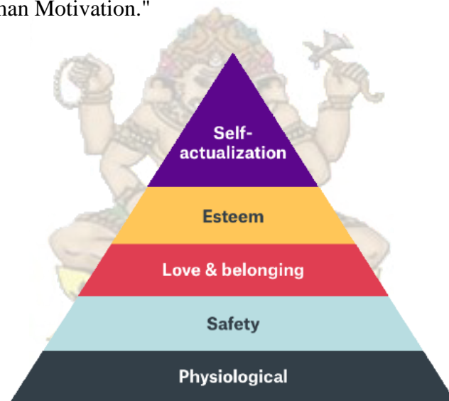
Figure 2.1 The Pyramid of Hierarchy of Needs by Abraham Maslow

In 1943, Abraham H. Maslow, an American psychologist, proposed an idea in psychology, namely the Hierarchy of Needs theory, through his paper "A Theory of Human Motivation."