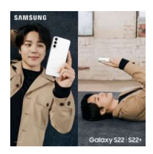
Figure 1. 1 Galaxy S22 5G – Phantom White – 128GB

The verbal signs seen in the advertisement above are the words "SAMSUNG" and "Galaxy S22 | S22+". The sign is a mark of the brand name and type of smartphone advertised in the picture above. While the visual sign in the advertisement above is a picture of "a smartphone held by a man who is one of the members of BTS, whose name is Jimin". This mark identifies in detail the display of the Samsung Galaxy S22 smartphone.