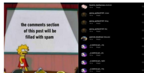
Figure 2 & 3

One of the interesting forms of communication that can only exist in social media is meme. Figure 2 of datum 2 possesses the ability of the image to bait people to flock into the comment section of the post. Figure 2 presents a meme with a command to dictate the viewers of the content: to order people to comment randomly (spamming). The author of 9GAG uses foreshadowing technique of how the comment will be filled with spams. This method attracts people to contribute to the spam filling of the comment section. The baiting process successfully influenced the followers to spam comments on the comment section shown in figure 3. The phenomenon promoted the content by elevating its insight on adding the number of comments of the post.