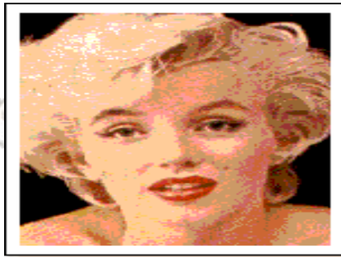
Figure 2.2 An American actress named Marilyn Monroe

As an example of the three order of signification, there is a sample from Susan Hayward (1996) used a photograph of Marilyn Monroe: