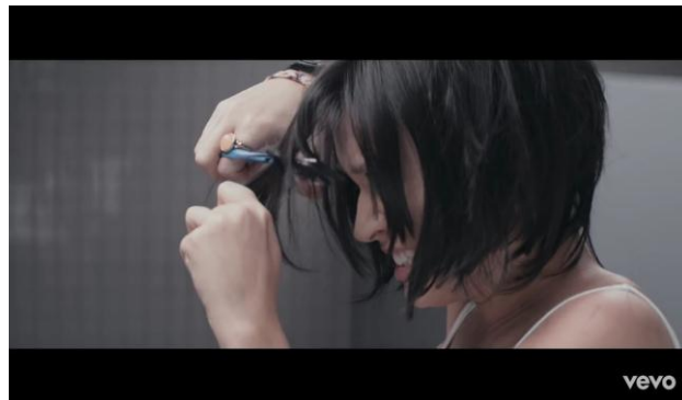
Figure 1.1 Katy Perry cuts her hair [01:15]

Below is the sample of analysis as follows: